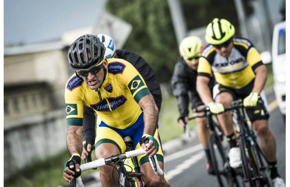
LOGO ON BIKER DRESS IS UP TO THE SPONSOR