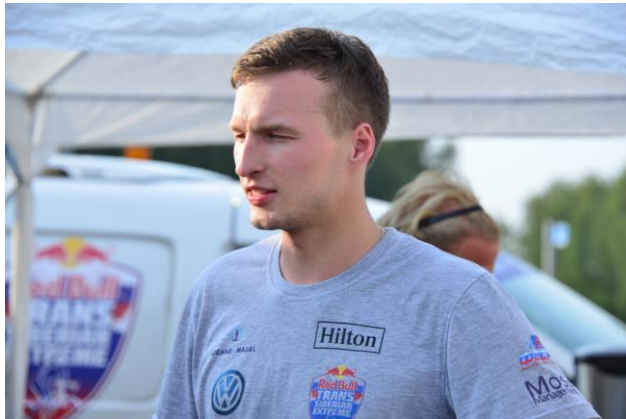
LOGO ON EVENT T-SHIRT