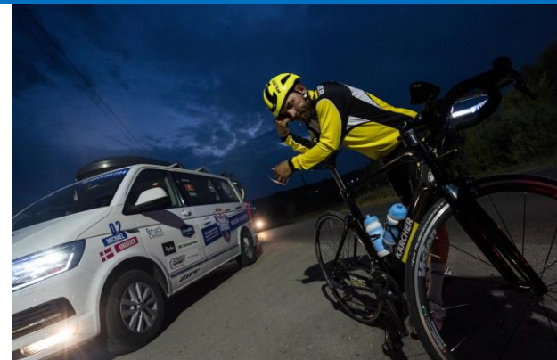
LOGO ON SUPPORT CAR