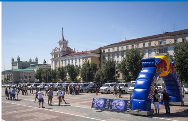
LOGO ON START GATE