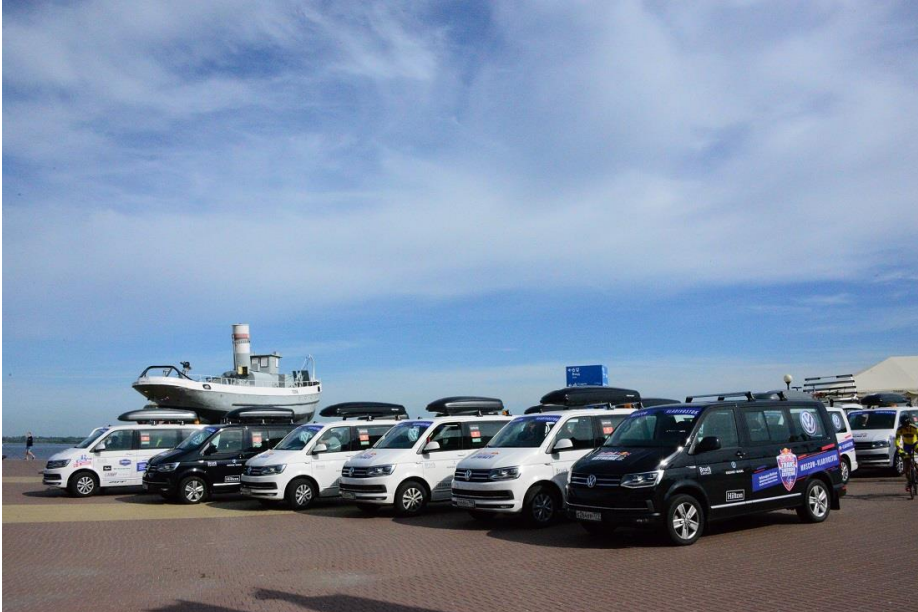
LOGO ON SUPPORT CARS